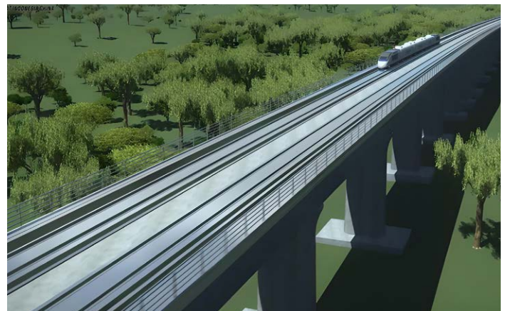
By streamlining workflows and improving efficiency and design quality, PT Wijaya Karya saved USD 185 million in construction costs and shortened the schedule by six months.

Meeting the accelerated deadline, WIKA delivered the fastest conventional high-speed railway in the world, with a maximum speed of 400 kilometers per hour. The project was delivered in time for several important events that will take place in Indonesia, including the ASEAN INDONESIA 2023 and the FIBA Basketball World Cup 2023. The provision of a globally competitive and sustainable high-speed line is a significant milestone of Indonesia becoming a developed country by 2035. Upon completion, WIKA is planning to replicate the success that it has achieved on the project, applying lessons learned, and leveraging the digital twin as its starting point for the design and construction of the next high-speed railway from Bandung to Surabaya.