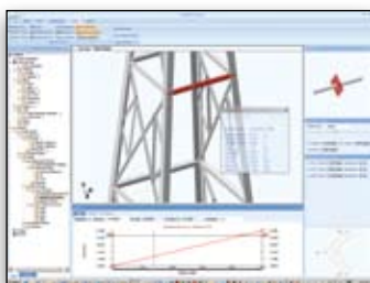
Get detailed in-sight of analysis results

Engineers can now model faster than ever using our physical model generation utilities thorough parametric wizards. This includes automatic and intuitive formation of physical members with appropriate orientations. It also