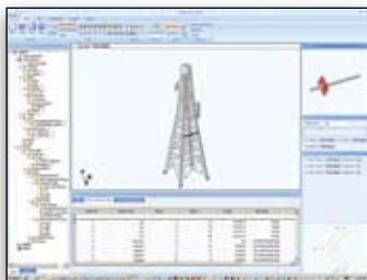
Construct parametric physical tower model

Engineers now have the flexibility to design physical members as per TIA-222-F and TIA-222-G codes. The design capability includes both trusses as well as frame member types. For each physical member the user can explicitly define the design parameters following the desired standard and can browse the detail design calculation with all allowable and actual values.