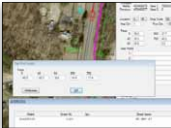
Users can easily access tap properties, port levels, and associated addresses.

After the design has been completed, Bentley Coax allows designers to power the plant. Powering is based on user-defined boundaries or power blocks that define the area to be powered. Designers have the option of changing the power count percentage when using power-passing taps. Bentley Coax also includes powerful reporting functionality. This includes bills of materials for all RF equipment and cable, bills of materials by build state, address list by node service area, and more.