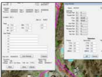
Detailed amp internals and distortion information are readily available.