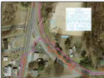
RF design calculations are performed as equipment is placed.

Bentley Coax is a robust RF engineering product that creates an intelligent coax network model during the design process. Bentley Coax works with Bentley® Fiber and Bentley® Inside Plant to create an end-to-end network model, allowing a hybrid fiber-coax network to be analyzed at any level, and ensuring accurate network documentation.