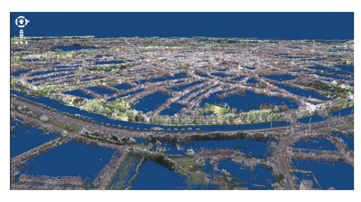
Manage massive amounts of companywide 3D mapping data