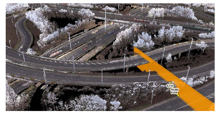
Analyze mapping data and create reports.