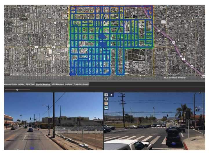
Upload and share 3D mapping data.

Simple procedures maximize the operator's productivity. Your team's activity, as well as the user's, is logged to create reports and get insights for finetuning your production.