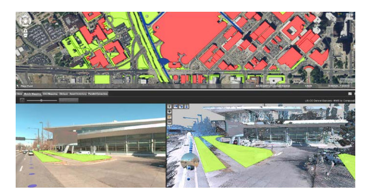
Navigate mapping data in full 2D or 3D view.