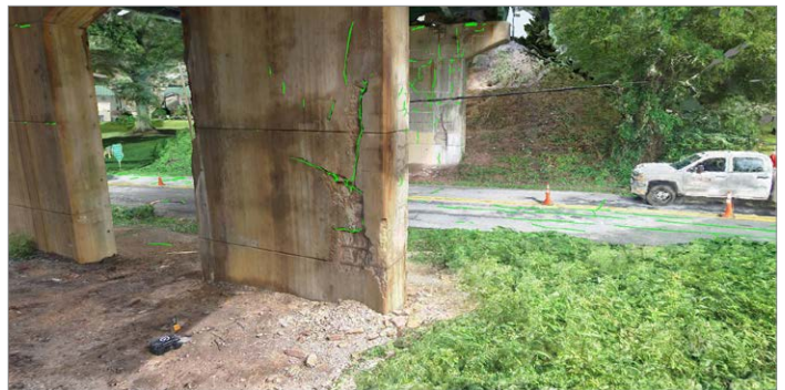
Leverage machine learning to automatically detect defects impacting infrastructure, such as cracks or spalling, to support inspection tasks.