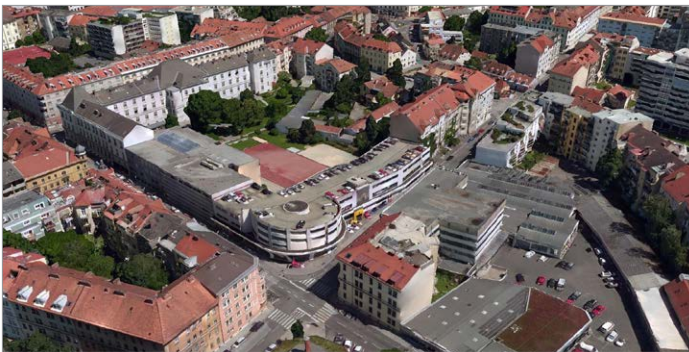
Enjoy advanced level-of-detail technology to ensure smooth navigation on city-scale scenes.