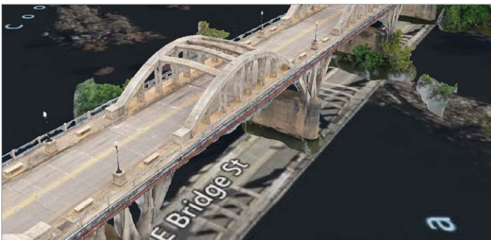
Review reality meshes in a web environment for visual checks.