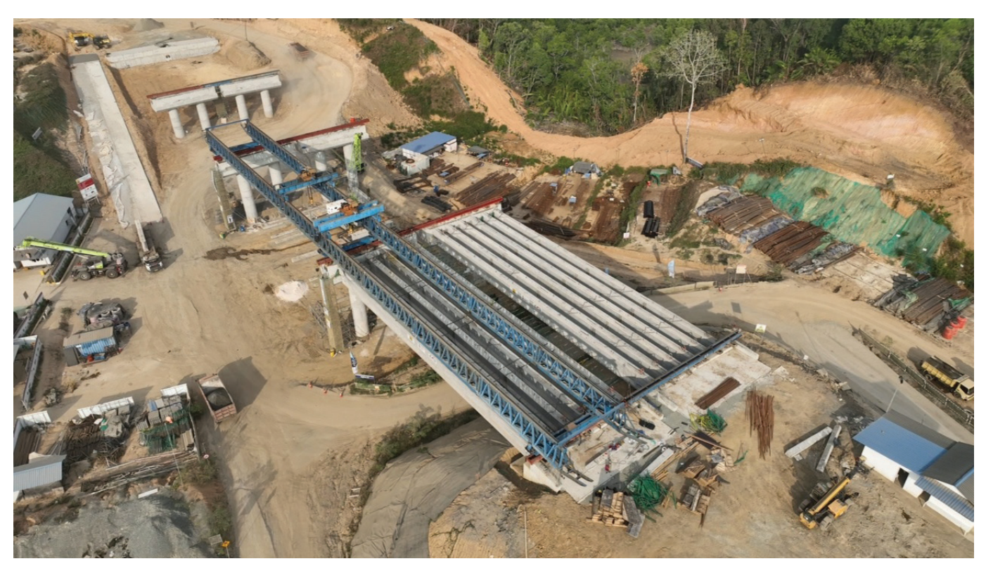
Waskita Karya is the main contractor responsible for the 6.675-km Simpang Tempadung-Jembatan Pulau Balang section 5A of the roadway network, connecting the new IKN VVIP Airport to the new capital's Central Government Core Area (CGCA) via the existing Pulau Balang Bridge.

Waskita Karya used digital tools to build section 5A of the IKN toll road