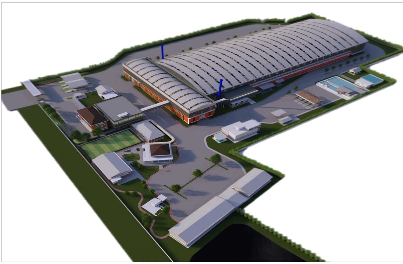
Leveraging Bentley's integrated technology applications, WIKA established a connected digital ecosystem and digital twin.