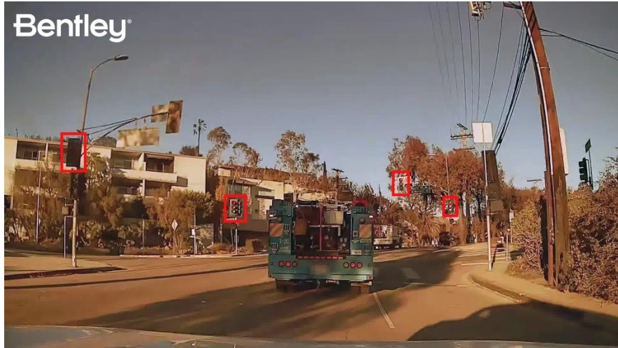
Caption: Malfunctioning streetlights are detected by Bentley's Blynscy technology in crowdsourced dash cameras in the Los Angeles area after wildfires caused major damage to critical safety infrastructure.