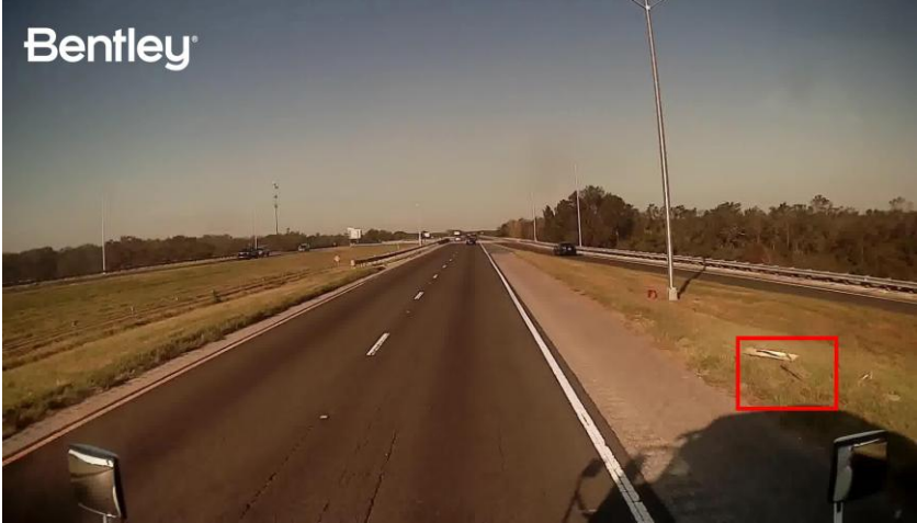
Caption: Bentley’s Blynscy AI technology detects a broken highway sign after Hurricane Helene in Florida.