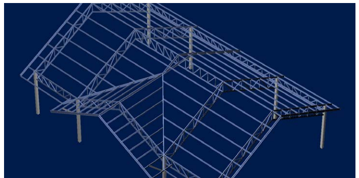
RAM Elements performs cold-formed steel design including optimization of these thin-walled sections subjected to bi-axial bending.