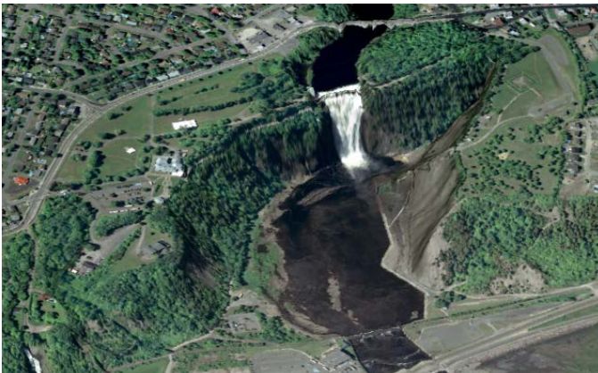
You can drape aerial photographs on scalable terrain models.

Reality meshes are rich, 3D scalable models of the real world, which are usually phototextured and automatically created from imagery ranging from simple smartphone photos to high-end photogrammetric cameras by using Bentley's iTwin® Capture. Bentley Descartes enables quick and easy manipulation of meshes of any scale, and can generate cross sections, extract ground and breaklines, and produce orthophotos, 3D PDFs, and iModels. In addition, you can integrate meshes with GIS and engineering data to enable intuitive search, navigation, visualization, and animation of that information within the visual context of the mesh.