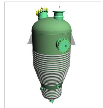
Vessel with limpet coils.