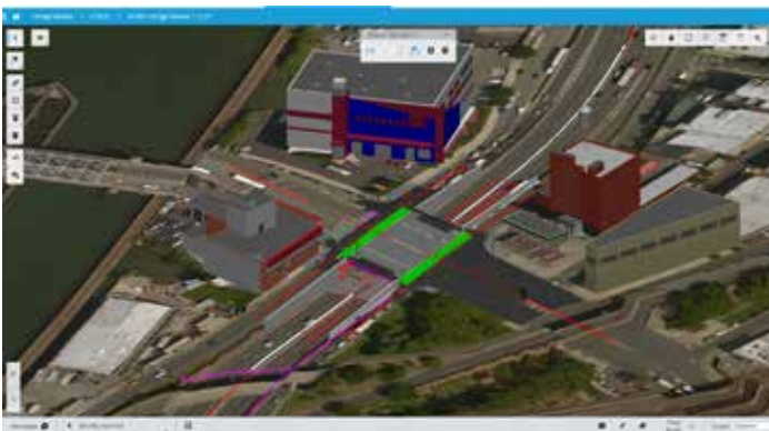
Using iTwin Design Review provided an integrated digital environment for more than 180 reviewers across 15 agencies to optimize design review and change management.

familiar with Bentley applications, NYSDOT selected OpenBridge Modeler, ProSteel, and MicroStation to develop a 3D model of the entire bridge structure to a level of detail that contractually enabled the team to build directly from the model, without requiring the aid of a complete set of 2D plans. The interoperability of Bentley's modeling software enabled NYSDOT to directly reference the highway designers' OpenRoads alignment file in the 3D bridge model, ensuring positional accuracy. Integrating iTwin Design Review to the project allowed more than 180 reviewers across 15 agencies to easily access and comment on the model in a digital environment.