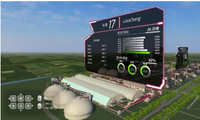
Using SYNCHRO 4D optimized plant layout and significantly reduced the construction cycle, reducing by 75%.

Using ContextCapture, they processed oblique photography to generate an accurate reality mesh of the entire site. With SYNCHRO 4D, they conducted construction simulation to visualize and achieve the precise plant layout and equipment installation within the limited space. Lastly, by integrating AssetWise® ALIM, MCC developed an engineering database to incorporate all asset information, design, procurement, manufacturing, construction, and installation data, laying the foundation for a digital factory deliverable.