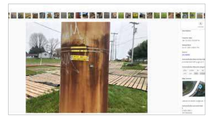
Easily search through your entire photo collection with AI-powered indexing tools.

Have the freedom to store data wherever you choose while maintaining a single interface and security model of all connected repositories. Store data as a digital construction model (iTwin®), which is accessible via cloud services and has the structure needed for construction, such as location, work, and organization breakdown structures.