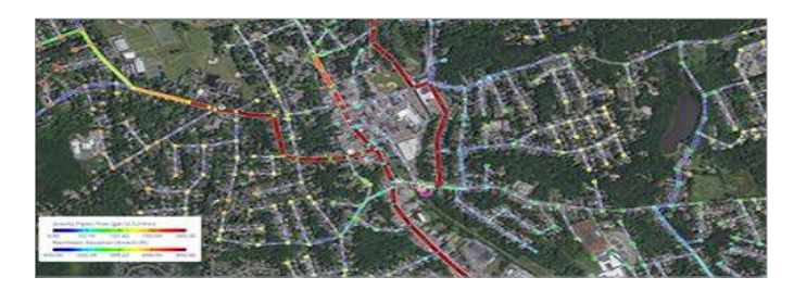
View a real-time simulation of your network.

Energy Efficiency: Minimize the energy needed for pumping while maximizing system performance by leveraging real-time analyses for each pump. These analyses indicate when pump performance is outside of service thresholds and quantifies energy inefficiency costs.