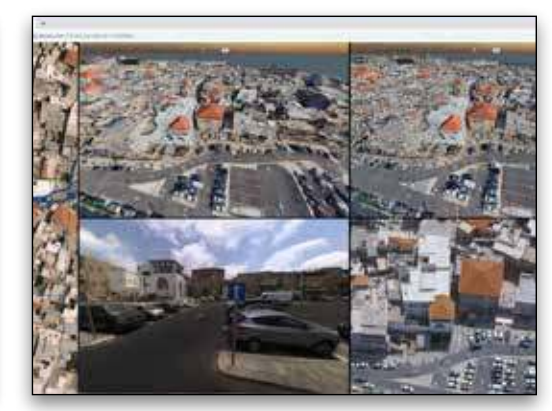
Show footprints on a basemap.