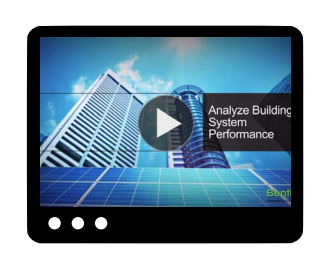
ANALYZE BUILDING SYSTEM PERFORMANCE