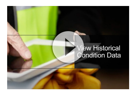
View historical condition data

Fully comply with government and industry regulations, including those from the U.S. FHWA. AssetWise helps you to meet requirements for FAST Act, MAP-21, and NBI requirements with off-the-shelf templates that allow for rapid implementation.