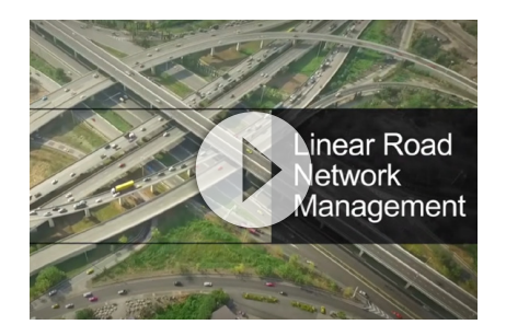
Linear road network management