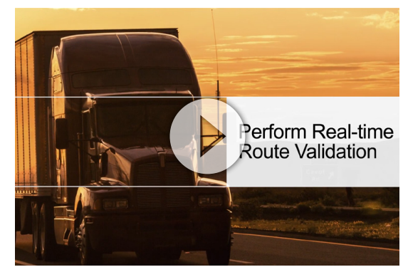
Real Time Vehicle Route Validation

SUPERLOAD bridge analysis performs bridge analysis for the specific permit vehicle configuration over each specific structure. An integrated live-load bridge analysis of each structure on the route determines safe passage feasibility and any speed or lane restrictions.