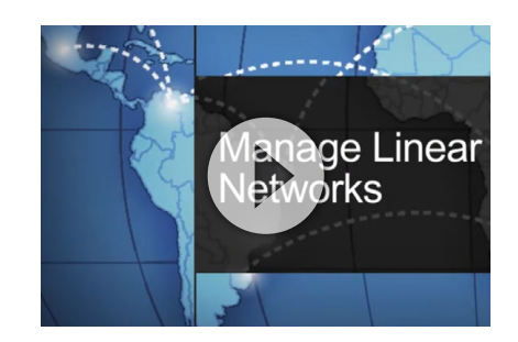
Manage linear networks