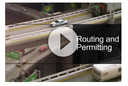
Routing and permitting