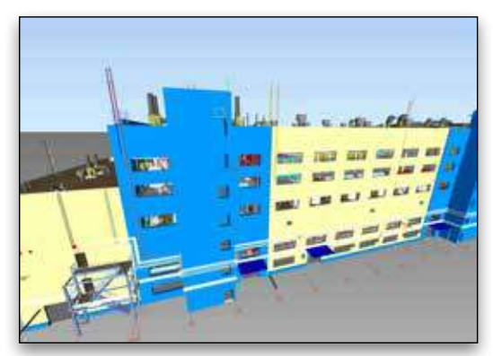
The new complex will significantly reduce Russia's dependence on imports of methylchlorosilane, and provide more than 700 jobs for the city of Kazan.

The software enabled the secure exchange of information so that any member of the project could see the most current information at any time. Version control was automated, eliminating concerns of using outdated documents and data. Working in a connected data environment improved accurate information sharing and the quality of design decisions. Integrating ProjectWise with OpenPlant and other Bentley applications provided a collaborative, comprehensive solution through federated information access, crucial to the successful delivery of the project.