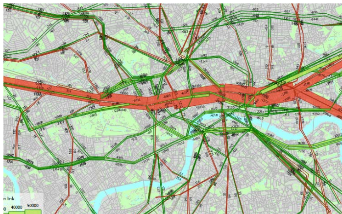
Change in a.m. peak period passenger volumes due to the Elizabeth Line.