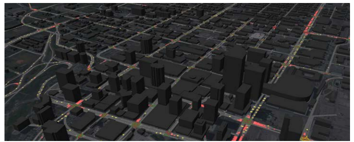
Bentley OpenPaths DYNAMIQ supports key decision support for operational traffic planning in lock-step with the city's capital planning project requirements.