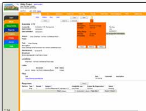
ProjectWise Construction Management's submittal module with an open risk item.