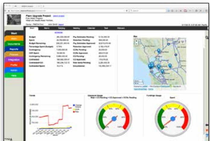
ProjectWise Construction Management's project-level dashboard.

ProjectWise Construction Management lets you manage contracts, finances, and risk exposure at the project, program or portfolio level. This is a powerful capability for construction managers and owner-operators that need to manage multiple projects and diverse funding sources.