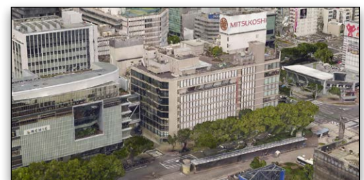
Models as large as city-scale can be reliably produced and shared.